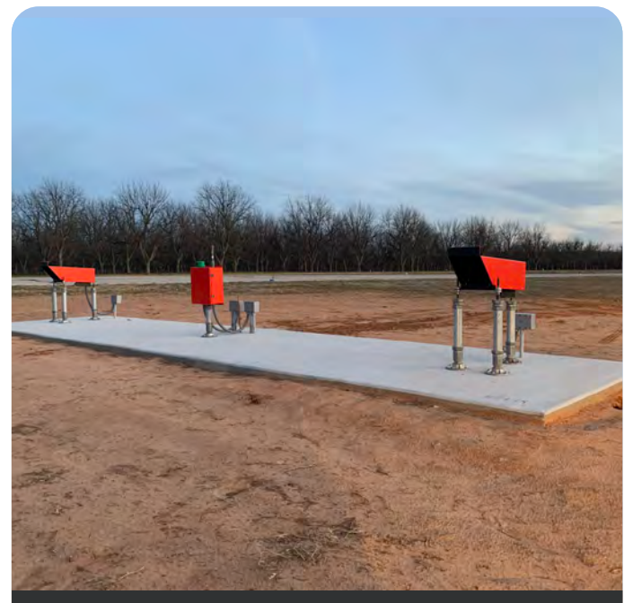
The Series 3 PAPI is Intertek certified to FAA AC 150/5345-28H. Patented LED technology provides the highest intensity, sharpest red/white transition line, and lowest power consumption.

The Landings Airpark also installed Avlite's AV-426 for solar LED runway lighting. The AV-426 features four, integrated and user-replaceable solar panels to provide over 100 hours of operating time. The AV-426 solar LED airfield lights to use Avlite's proprietary AvMesh communication protocol. This allows each light to function independently of one another within a light group for optimal lighting flexibility. Intensity settings can be easily adjusted for local conditions and specific locations.