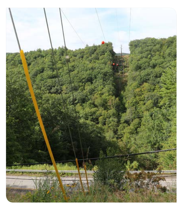
Towers supporting CHG&E's transmission lines utilize Avlite's A-O Obstruction Light Kits.

Central Hudson's electric transmission system of 600 pole miles of line. It also has an electric distribution system of 7,200 pole miles of overhead lines to serve its residential, commercial and industrial customers. Infrastructure replacement initiatives identified a critical safety area that needed attention: obstruction lighting on some transmission and distribution towers was unreliable, intermittently operated, and required ongoing maintenance. Access to the effected transmission and distribution towers was difficult due to the 4,000-foot peaks of the nearby Catskill Mountains.