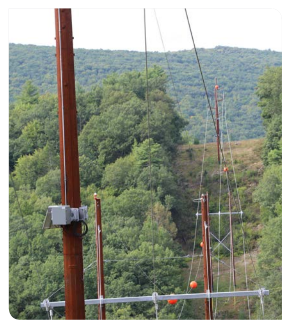
Each tower on the 69kV transmission line carries Avlite's A-0 Obstruction Lighting Kit, consisting of dual L-810 light at the top and control unit in a solar power configuration.