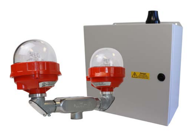
Avlite's A-O Obstruction Lighting Kit consists of a dual L-810 light and control unit and is designed as a turnkey lighting solution, ready to use out of the box.

With the installation of Avlite's A-O Obstruction Lighting Kits, Central Hudson Gas & Electric was able to help increase the safety of aircraft operations in the surrounding areas, meet its corporate objectives of maintaining infrastructure by upgrading to full functioning obstruction lighting, and be a strong energy community partner as Avlite's LED technology operates with minimal power consumption.